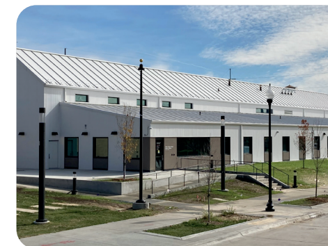
The Miracles Program provides 80 residential addiction treatment beds for men and women who are experiencing homelessness.