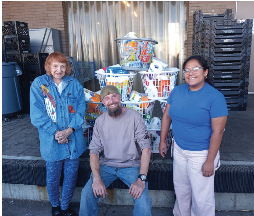
Your generous donations can help keep guests safe this summer.