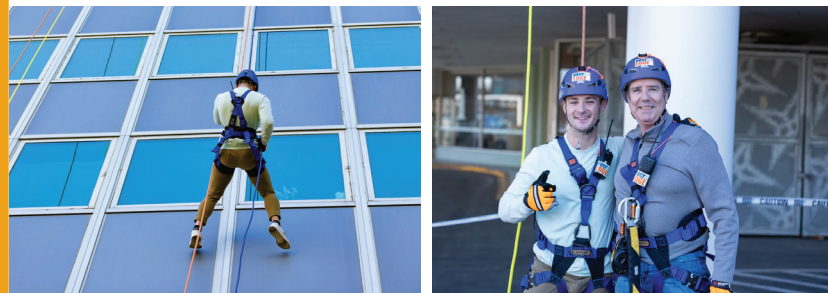
Supporters prepare to repel down 20 stories of the Highline Building in downtown Omaha.

We are so grateful to everyone who participated — for their courage, enthusiasm and commitment—as they literally took a leap of faith for Siena Francis House, rappelling down 20 stories to raise funds. Thank you for helping us kick off our 50th anniversary year in such a breathtaking way!